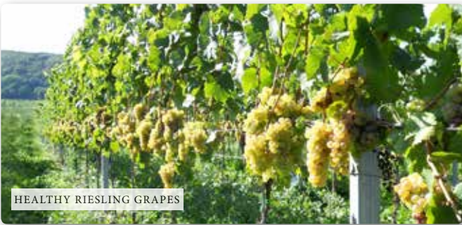
HEALTHY RIESLING GRAPES