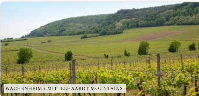
WACHENHEIM / MITTELHAARDT MOUNTAINS

The goal at Villa Wolf is to produce wines that express the pure, authentic terroir of the Pfalz. Made in the classic style of the Pfalz, Villa Wolf wines are dry and full-bodied, with fully ripe fruit flavors and a characteristic stoniness in the aroma. To preserve the naturally high quality of the vineyards, we employ sustainable viticultural practices and emphasize gentle handling of the fruit through traditional, minimalist winemaking.