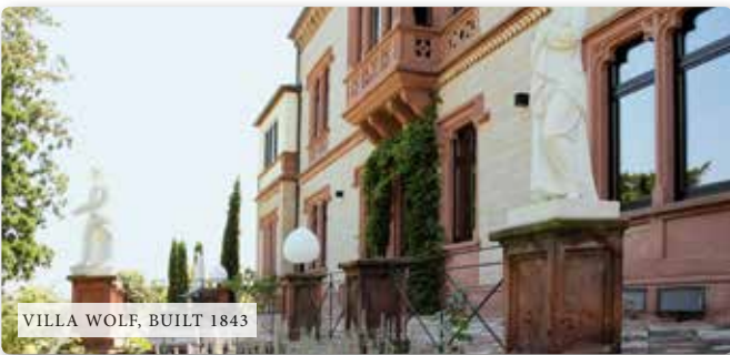
VILLA WOLF, BUILT 1843

Wachenheim an der Weinstraße is a small town in Rhineland-Palatinate, Germany. The vineyards in this area have well-drained, weathered sandstone soils, with chalky and limestone components. At Villa Wolf, we use an unofficial, Burgundy-style classification of the vineyards, based on an 1828 property value assessment done by the Bavarian government. There are three levels of vineyard quality: First Growth (grand cru), Second Growth (Premier Cru) and Village vineyards.