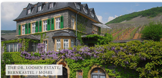
THE DR. LOOSEN ESTATE, BERNKASTEL / MOSEL

The weathered red volcanic and slate soil of Ürziger Würzgarten makes it unique on the Mosel. High iron content in the soil gives the vineyard its vivid color.