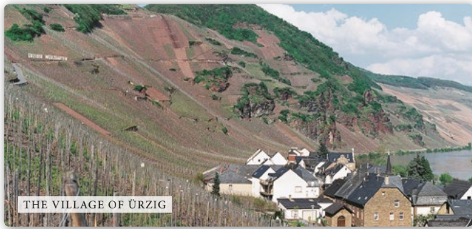
THE VILLAGE OF ÜRZIG