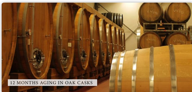
12 MONTHS AGING IN OAK CASKS