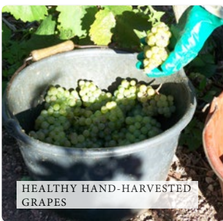
HEALTHY HAND-HARVESTED GRAPES