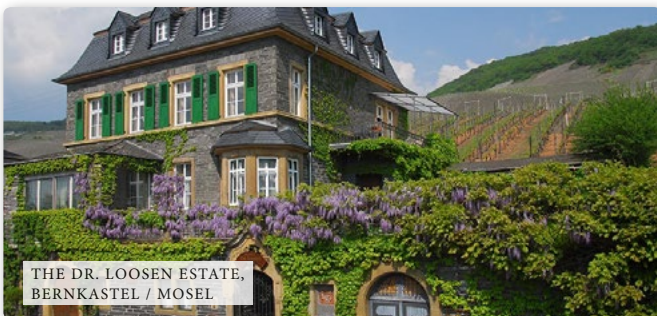
THE DR. LOOSEN ESTATE, BERNKASTEL / MOSEL

The soil in Wehlen is composed of broken and weathered shards of the purest blue slate in the Mosel valley. This purity is reflected in the wines.