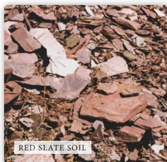
RED SLATE SOIL