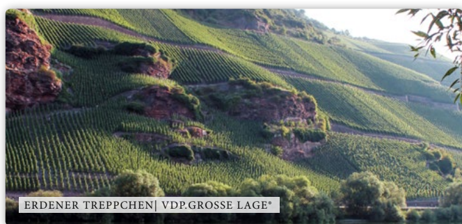
ERDENER TREPPCHEN | VDP.GROSSE LAGE*