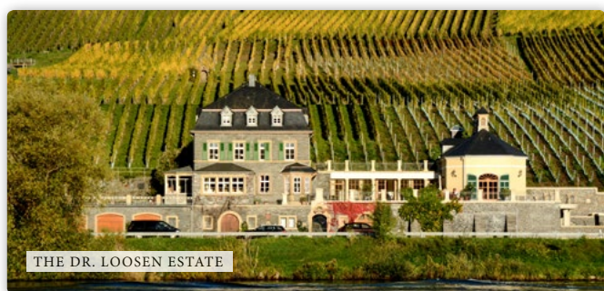
THE DR. LOOSEN ESTATE

[91+] Mosel Fine Wines, 2018 vintage The 2018er Erdener Treppchen Riesling Kabinett was harvested at 82° Oechsle and was fermented down to fruity-styled levels of residual sugar (45 g/l). The wine proves quite reductive and slightly marked by some sulfuric elements at first. It takes a few minutes until scents of smoke, dried herbs, earthy spices, grapefruit, mint, and wet slate emerge from the glass. The wine comes over as relatively big and juicy on the palate, where some ripe yellow fruits and almond are lifted up by quite some citrus fruits as well as fizzy elements from the CO2. The finish is intense, vibrating, and refreshing. The gorgeous Kabinett will need quite some time to find its balance, and prove then surprise us all. 2026-2038