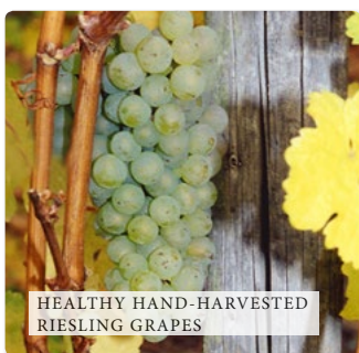
HEALTHY HAND-HARVESTED RIESLING GRAPES

The Mosel Valley's Iron-rich red slate is less common than the more prolific blue slate found throughout Germany's Middle Mosel. Red slate is found mostly in the villages of Erden, Ürzig and Kinheim.